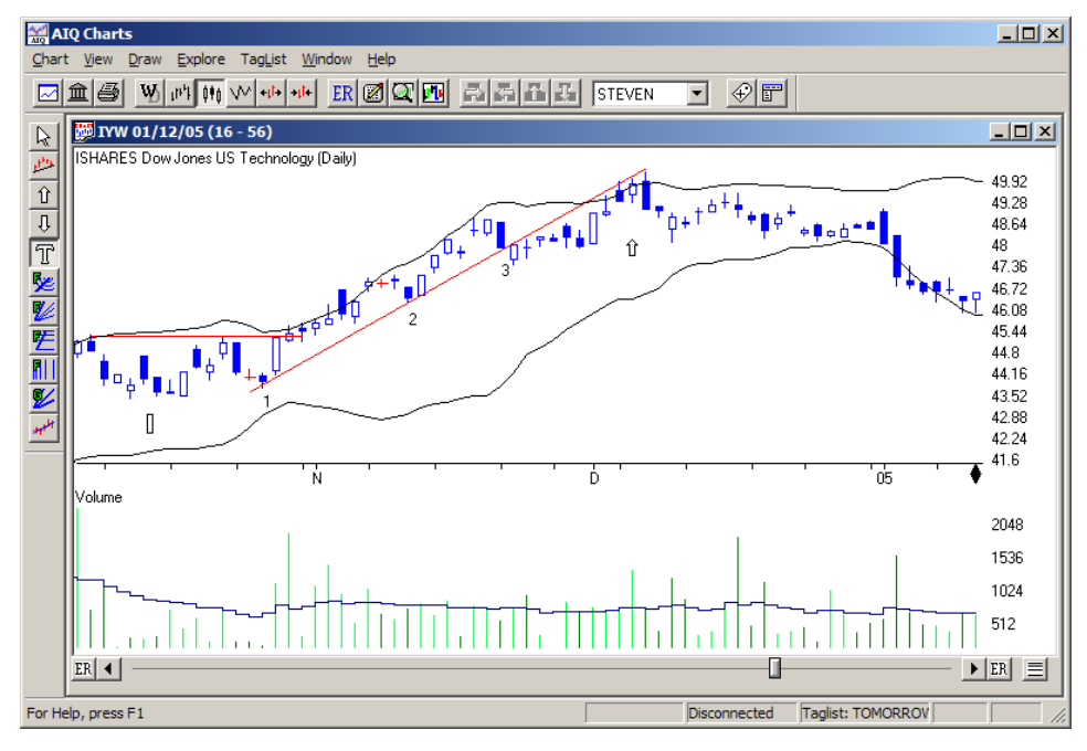
Figure 3 . Daily candlestick chart for IYW showing trendline exit point (arrow).

IYW broke the ascending trendline at point 3 on Figure 3. If I took profits at point 3, I would have captured much of the move. The trendline break exit approach does not capture as much of the run as the "rat tail" approach outlined above does, but it results in a nice profit and allows putting the money to work elsewhere two weeks earlier. There is nothing wrong with taking some profits early, but there