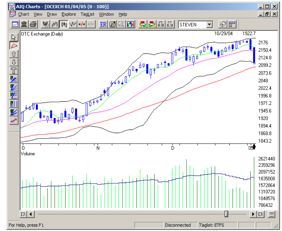
Figure 1. Nasdag chart showing period of market up trend (mid Oct. 2004 to start of Jan. 2005).

When the market is trending I also trade more types of patterns. For example, base breakouts are usually not interesting in a trading range market, but are one of the patterns I look for when the market is trending. As shown in Figure 2 , iShares Technology (IYW) had formed a narrow base during October. On 10/28/04, IYW moved above the top of the recent range on twice-average volume (see arrow). Since volume measures the pressure behind or interest in a move, the break from a trading range on twice-average volume is a significant event.