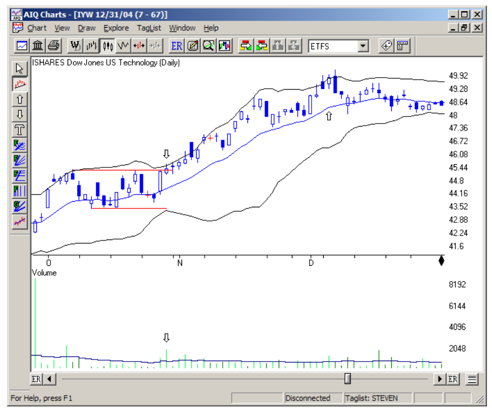
Figure 2 . Daily chart of iShares DJ US Technology ETF (IYW). Horizontal trendlines define Base Trading Pattern in Oct. 2004 followed by breakout (down arrows) on above avg. volume.

On the IYW chart (Figure 2), "rat tails" appear three days in a row in early December, as marked